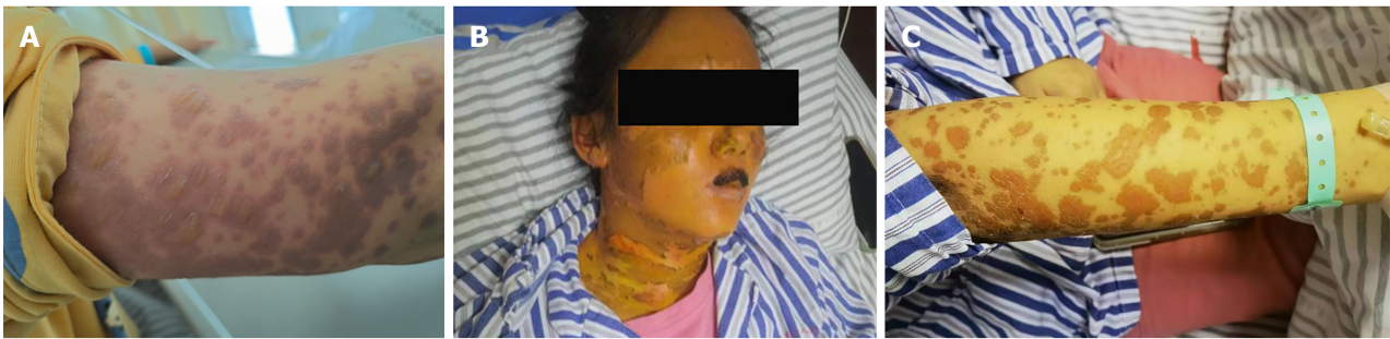
Figure 1 Facial symptoms of the patient with Stevens–Johnson syndrome and toxic epidermal necrolysis after coronavirus disease 2019 diagnosis. A: Skin injury on the upper arm on day 9 of the disease course; B and C: On day 13 of the disease course, the skin rash on her face and arm started falling off and was resolved after three courses of double plasma molecular adsorption system.