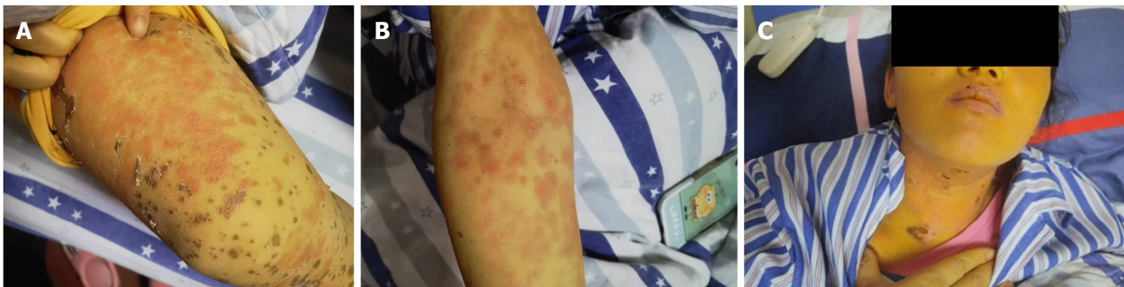
Figure 4 After stopping the double plasma molecular adsorption system treatment, new skin lesions appeared. A-C: New skin lesions on the inner thighs, arms, and face.

Scoring: > 9 = definite; ADR: 5–8 = probable; ADR: 1–4 = possible; ADR: 0 = doubtful ADR; Patient's score = 3.